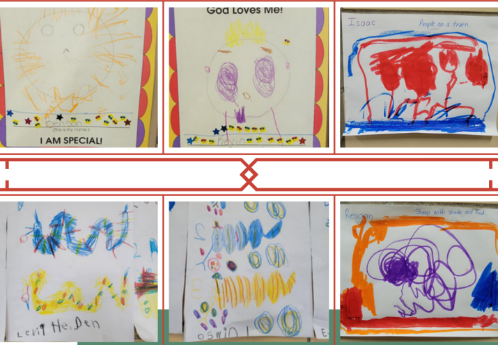
Contribution by: Pk3 & 1st Grade