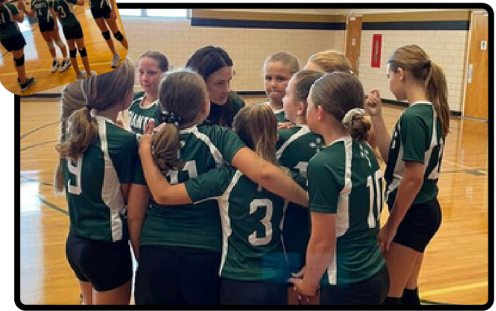
Our Girls Volleyball Team is made up of awesome young athletes who love playing together and having fun on the court. They practice hard to get better and always cheer for each other. They're not just teammates; they're like a big volleyball family! We're super proud of them!